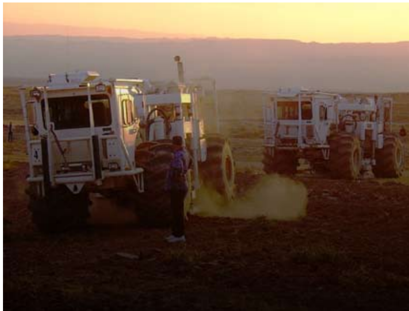
Seismic in Kurdistan